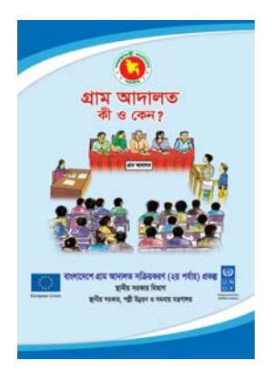
Ô /illage Courts: What and Why? Õ a pocket card describes legal provisions and procedures of village courts which will guide relevant stakeholders effectively