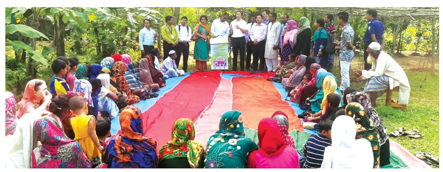
Delegates of European Union interact with community people of Balaganj Upazila, Sylhet on village courts services