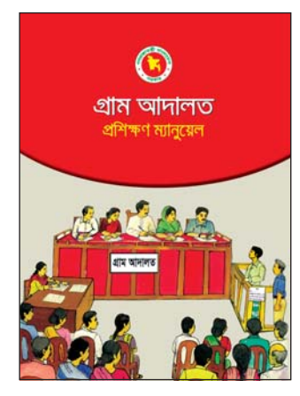
AVCB II Project and District Training Pool (DTP) members use this training manual for capacity development of village courts service providers. This manual was endorsed by NILG.