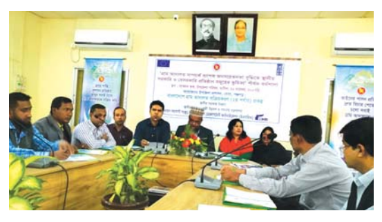
For developing massive awareness on village courts local representatives of various government institutions and non-government organizations share their suggestions during an outreach workshop. A total of, 200 outreach workshops were organized in the project working areas