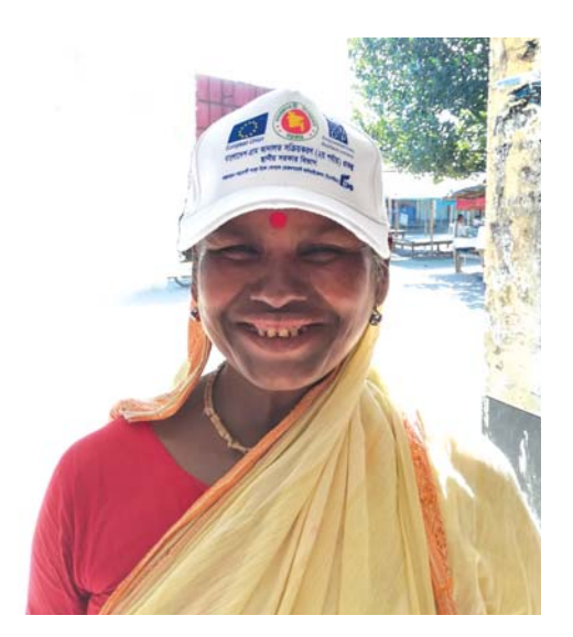
A community participant of a village courts 0 rally, like her, 383,755 people participated (121,545 women) in 1,906 rallies at 1,080 unions

Village Court Assistant (VCA) facilitates courtyard session for raising awareness on village courts among community people particularly women, poor and disadvantaged groups. In 2017, 1,838,726 people (1,250,604 women) were reached by 108,868 courtyard meetings