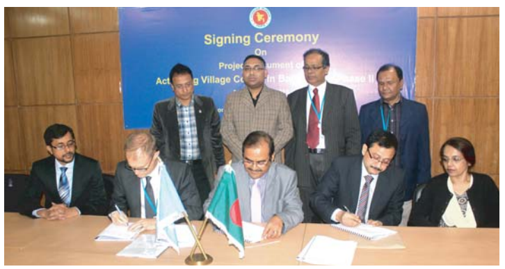
Representatives of Local Government Division, European Union and UNDP sign the Project Document for O Activating Village Courts in Bangladesh Phase II O on 30 December 2015. The project follows this document in undertaking all relevant interventions to contribute in improving access to local justice for disadvantaged and marginalized groups in Bangladesh